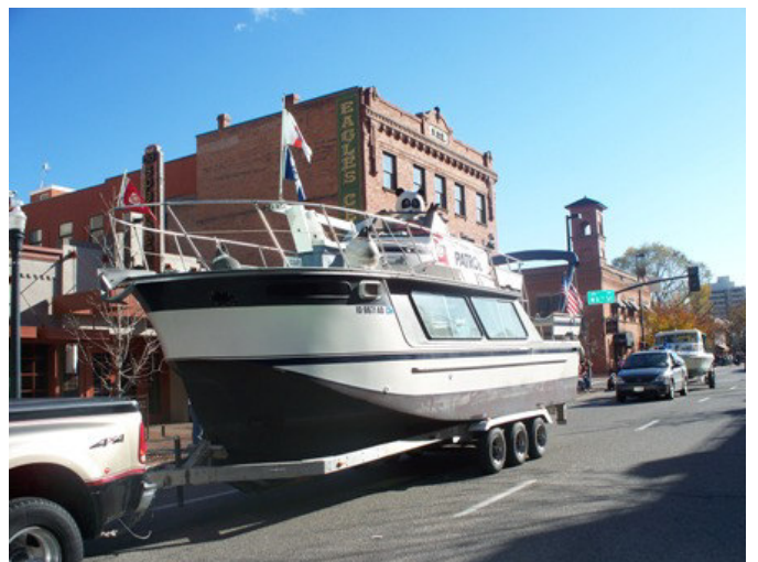
Our U.S. Coast Guard fleet of vessels. Always assisting boaters who are in need of help on the numerous Reservoirs in Idaho waters