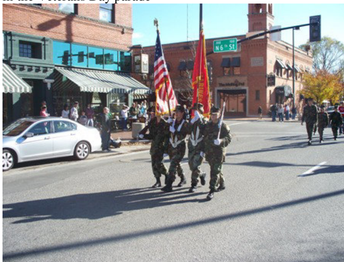
Gem State Young Marine Color Guard