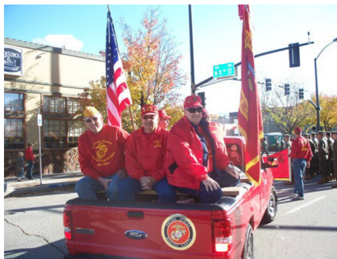
Our MCLeague Treasure Valley Detachment, 878