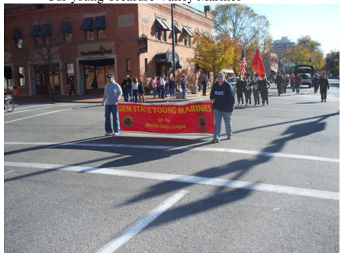
Gem State Young Marines from Caldwell