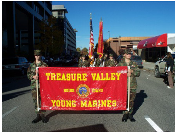
Our young Treasure Valley Marines