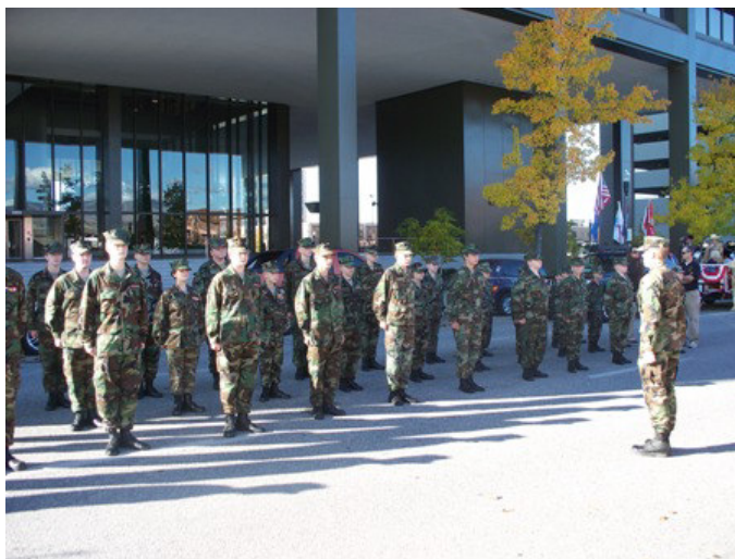
Treasure Valley Det. Young Marines preparing to march off in the Veterans Day parade