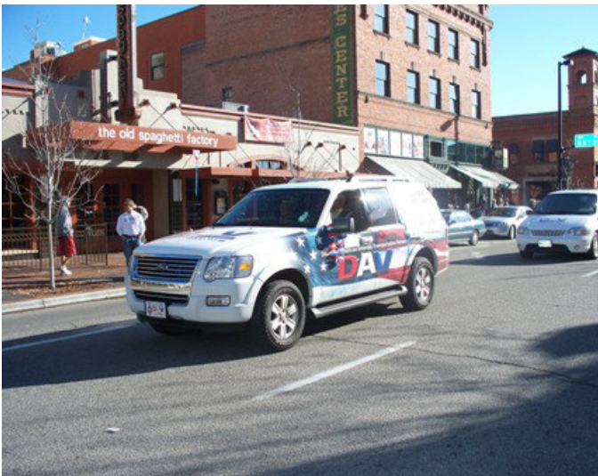
DAV and their convoy of Vans who are always there in the VA Medical Center parking lot to assist our veterans