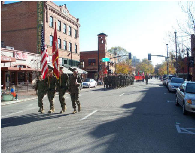
Color Guard from Charlie Company, 4 th Tank Bn