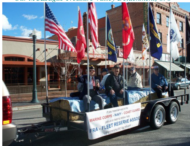
FRA- Fleet Reserve Association